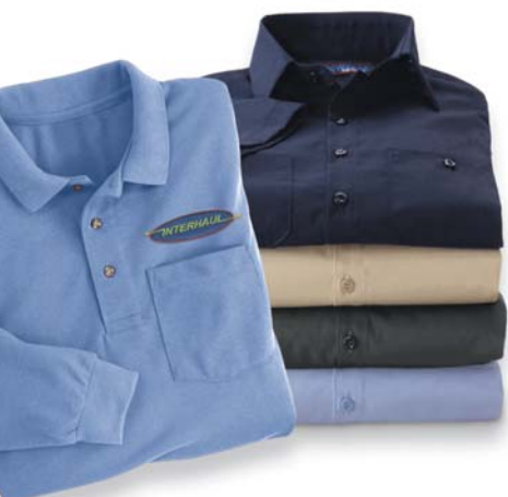
A broad selection of quality workwear options for all departments and job types.