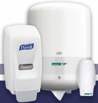
Superior hand care products, paper supplies, and air fresheners for restrooms and other areas.