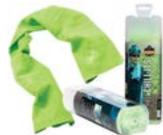
CHILL-ITS® COOLING TOWEL Synthetic towel 12439 13" x 29.5"