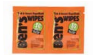
TICK AND INSECT REPELLENT WIPES 8351

When working outdoors in the heat, it's important to have protection from sun exposure and excessive heat, as well as insect bites and poison oak and ivy.