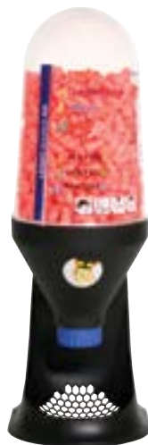
LEIGHT SOURCE 400 EARPLUG DISPENSER Durable plastic design is an economical choice for dispensing earplugs. Mounts to wall or stands as table-top dispenser with balanced footing. LS400 MAX® EARPLUGS DISPENSER REFILL for LS 400 dispenser. NRR 30dB. MAXLS4