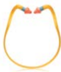
QB-3HYG BANDED EARPLUGS NRR 23dB 7019 Each