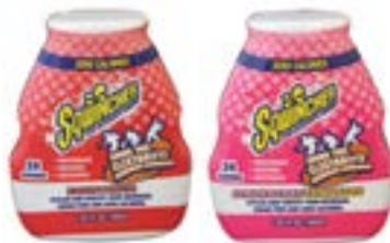
SQWINCHER® BEVERAGE ENHANCER Hydrate and recharge the body with the perfect sugar free electrolyte beverage concentrate. No sugar, no calories. Each bottle yields 24-8 oz. servings. 9651 Fruit Punch, 6/box 9652 Strawberry Lemonade, 6/box