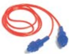
AIRSOFT® REUSABLE EARPLUGS NRR 27dB 7010 Corded, 100 pair