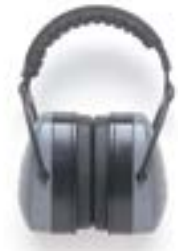
THUNDER® EARMUFFS NRR 30dB 7081 Each