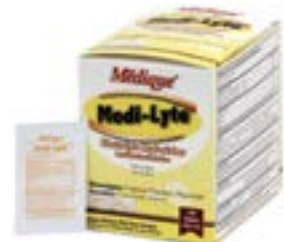
MEDI-LYTE® Sodium-free, sugar-free, and lactose-free relief from heat stress, fatigue and muscle cramping due to minerals lost to heat and perspiration. 03033 100/box