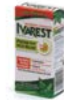
IVAREST® CREAM 3108 2 oz. tube