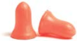
MAX® EARPLUGS NRR 33dB (highest NRR available) 7007 Corded, 100 pair 7006 No cord, 200 pair

We carry Howard Leight earplugs, ear bands, and earmuffs in a range of noise reduction ratios (NRR) for many different work environments and applications.