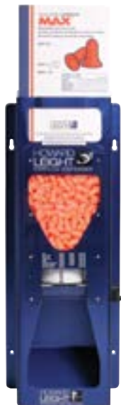
LEIGHT SOURCE 500 EARPLUG DISPENSER Heavy-duty anodized aluminum withstands constant use. Mount on wall for easy access. 7031 MAX® EARPLUGS DISPENSER REFILL for LS 500 dispenser. NRR 30dB. 7030 500/box