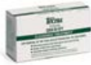
TECNU OAK-N-IVY WIPES 23202 4/box