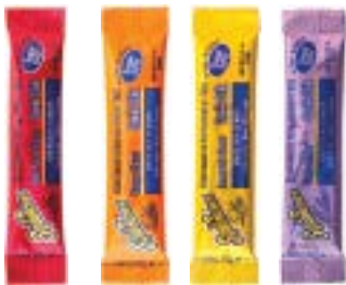
SQWINCHER® ZERO QWIK STIK Great-tasting drinks don't need sugar. Just ask your water bottle. Sqwincher ZERO Qwik Stik lets you take all the electrolytes you need wherever you go. Just add a Stik to a 20 oz. bottle of water and you'll have a perfectly balanced drink.