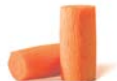
MATRIX® EARPLUGS NRR 29dB 7035 Corded, 100 pair 7034 No cord, 200 pair