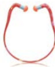
QB-2HYG BANDED EARPLUGS NRR 25dB 7014 Each 7016 QB200 replacement pods