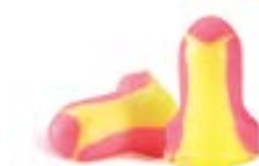
LASER LITE® EARPLUGS NRR 25dB 7009LL Corded, 100 pair 7008LL No cord, 200 pair